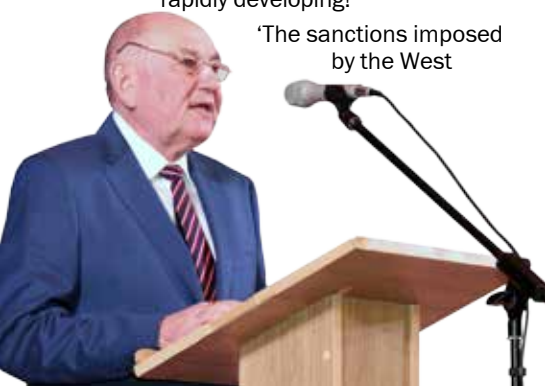
'The sanctions imposed by the West